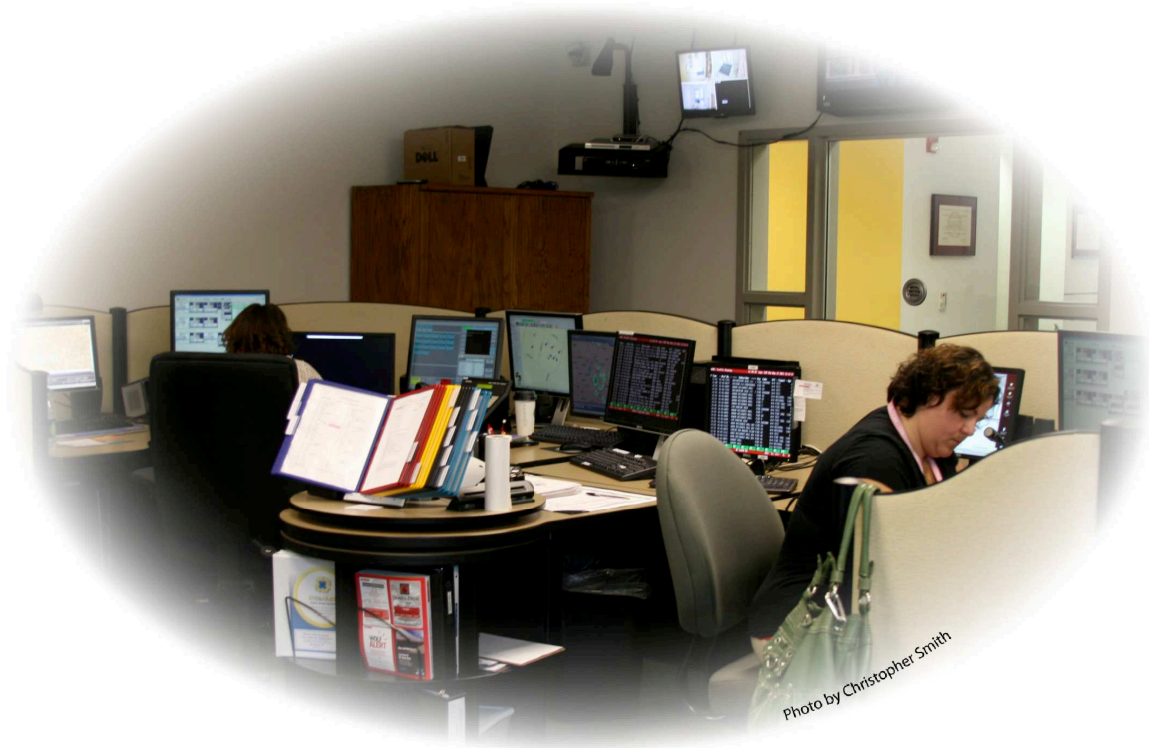
NC State's Emergency Communications Center control room

"There are clear examples of this system working," said Crew. "I think the solution is not to depend on any one warning technique but a variety of them, as the WolfAlert system demonstrates. And any warning systems we have now, or will develop in the future, will only be as good, and only as effective, as we're willing to make them by practicing and drilling and conducting public education and outreach campaigns, so that people will know what to do and where to go and how to behave when they hear those alarms."